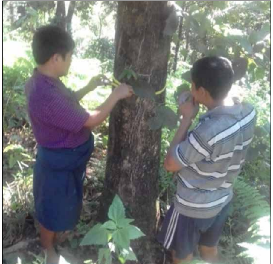
Diameter measurement by CFMG members

Now after the lapse of 10 years, during the final evaluation of the CF, there was a need to carry out quantitative forest resource assessment as the plantation has grown up and the barren area was covered with vegetation of Sal ( Shorea robusta ) Champ ( Michelia champaca ), Khamari ( Gmeliania