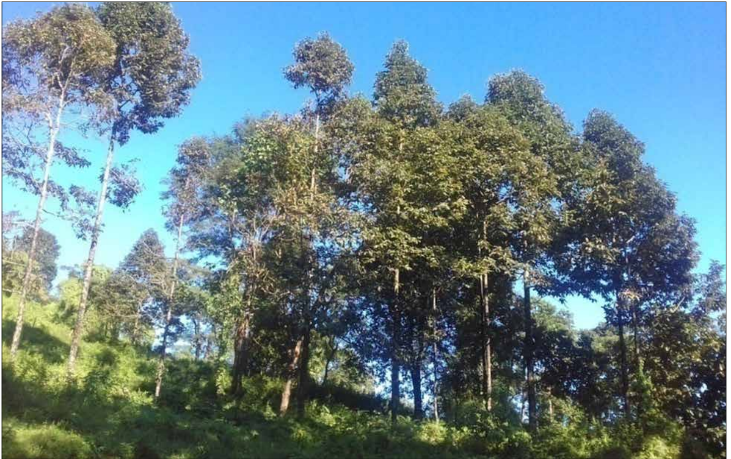
Michelia champaca plantation